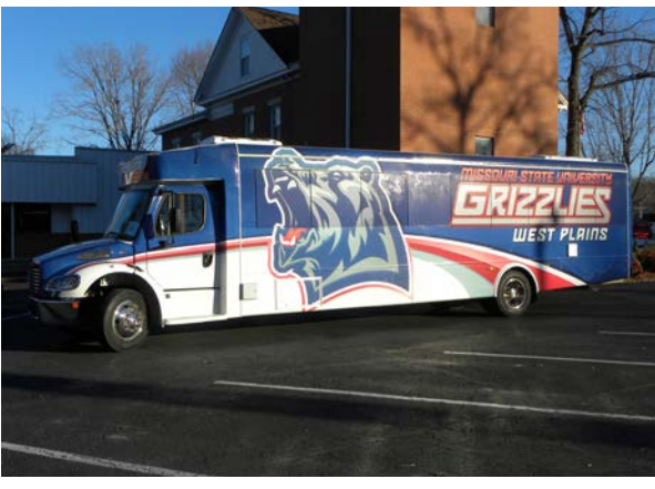
Teams will travel to away games on the new Grizzly Bus!

University officials said the new softball and esports programs will enhance the collegiate experience for current students and bring new and expanding interest in MSU-WP from prospective students and area residents.