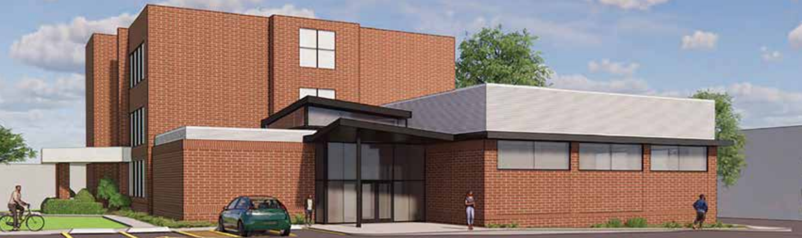
This initial concept design from the Missouri State University Office of Planning, Design and Construction shows the 2,000-square-foot addition on the southeast corner of Looney Hall.