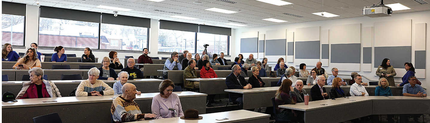
The Dr. Marvin L. Fowler Lecture Hall