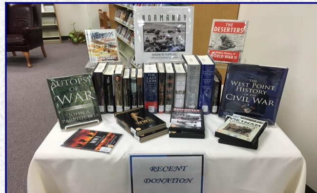
A recent donation of books and DVDs on WWI, WWII, Vietnam War, & other history topics is on display in Garnett Library. All donations are welcomed and will either be added to the library's collection or will find a new home.