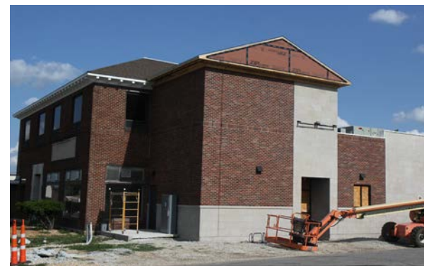
Construction is nearing completion at the Terry L. “Bo” Pace Industrial Science Center.