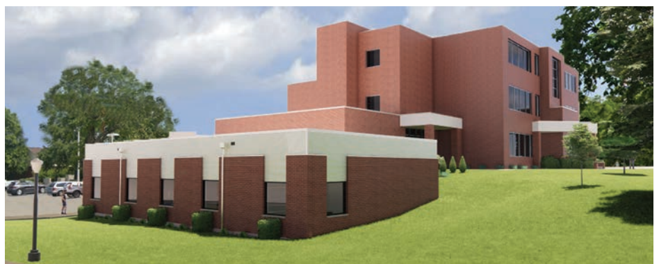
Above is an artist's rendering of the hospital simulation lab at Looney Hall.

In June, Missouri Gov. Mike Parson signed legislation that included an additional $1.25 million in MoExcels funds for the hospital