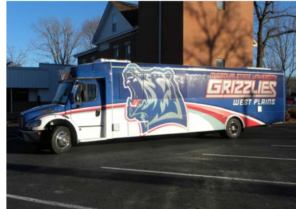
Teams will travel to away games on the new Grizzly Bus!

University officials said the new softball and esports programs will enhance the collegiate experience for current students and bring new and expanding interest in MSU-WP from prospective students and area residents.