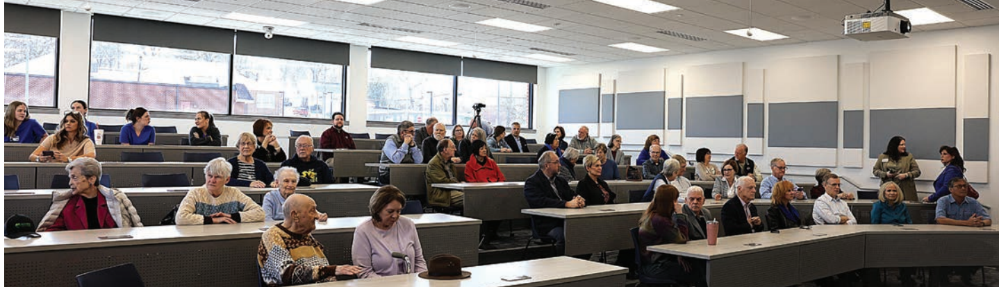
The Dr. Marvin L. Fowler Lecture Hall